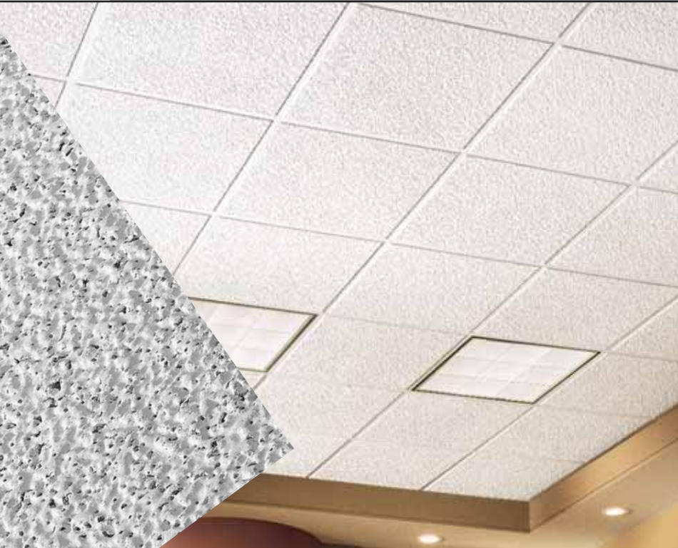
DESIGNER Angled Tegular with PRELUDE® 15/16" Exposed Tee grid