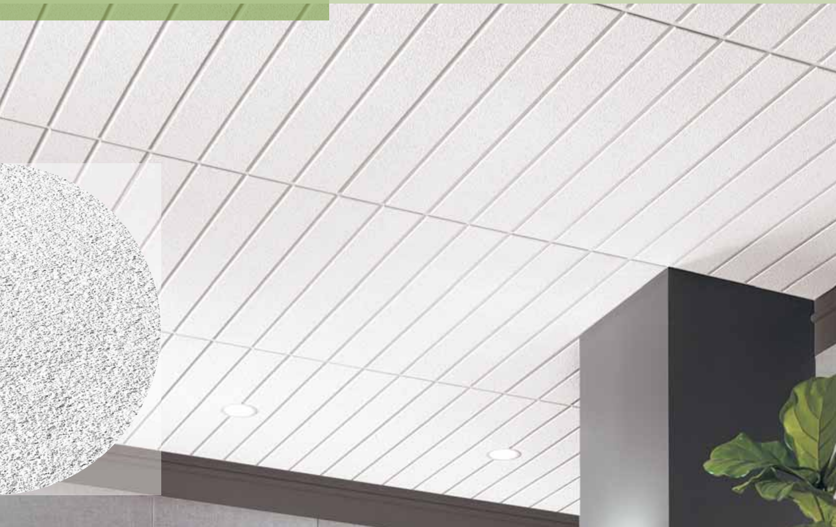
Cirrus Second Look III with Suprafine® 9/16" Exposed Tee grid